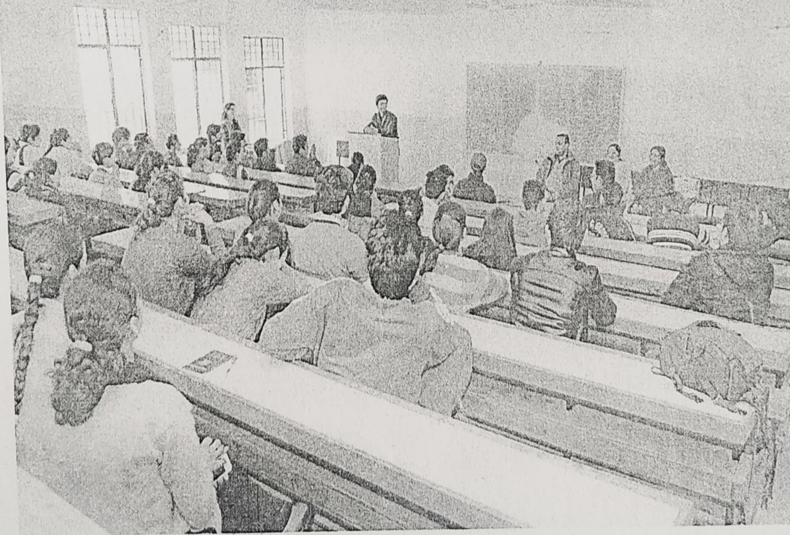
NSS VOLUNTEERS PRESENTING 7- DAYS CAMP REPORT